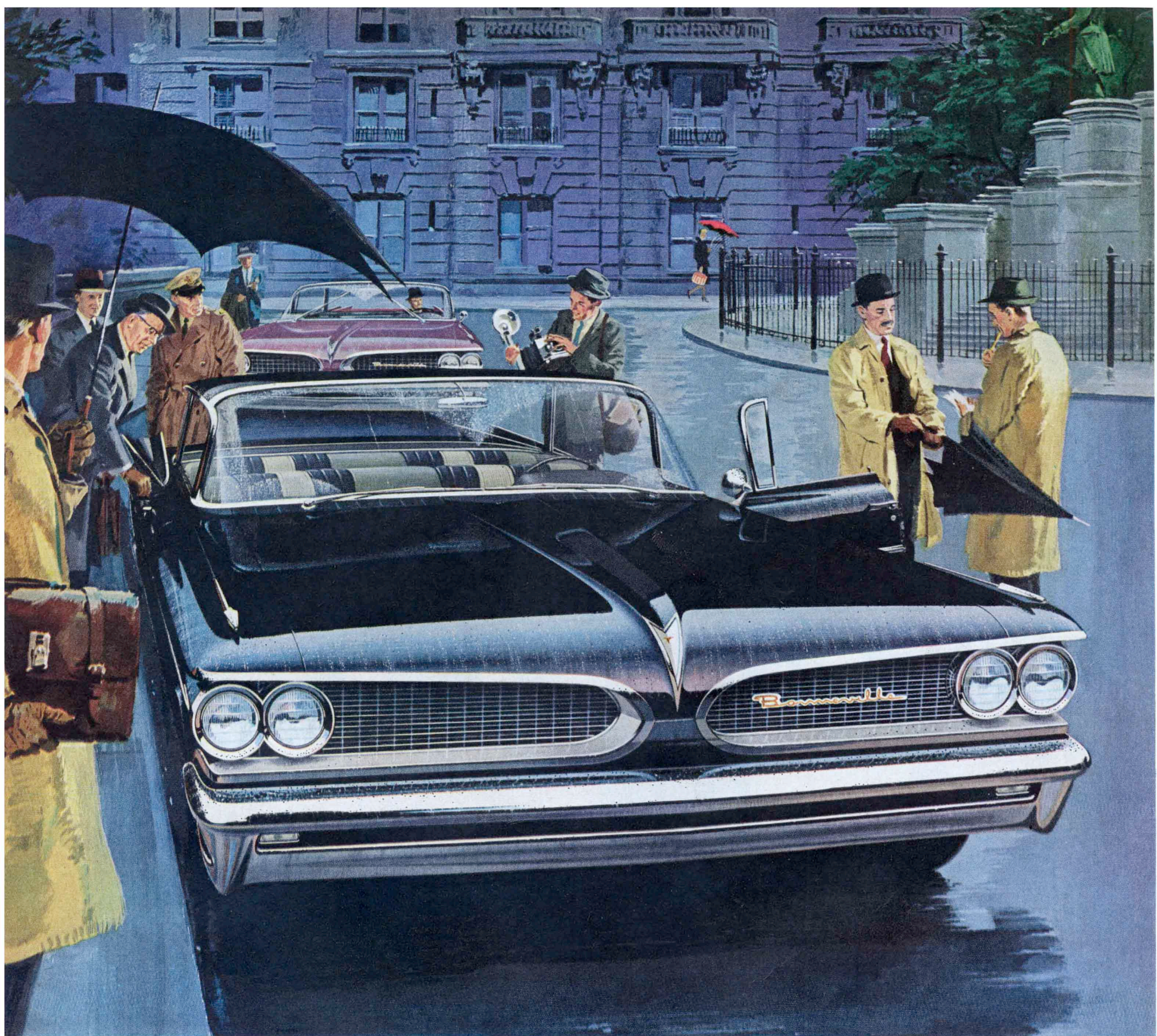
YOU GET THE SOLID QUALITY OF BODY BY FISHER.