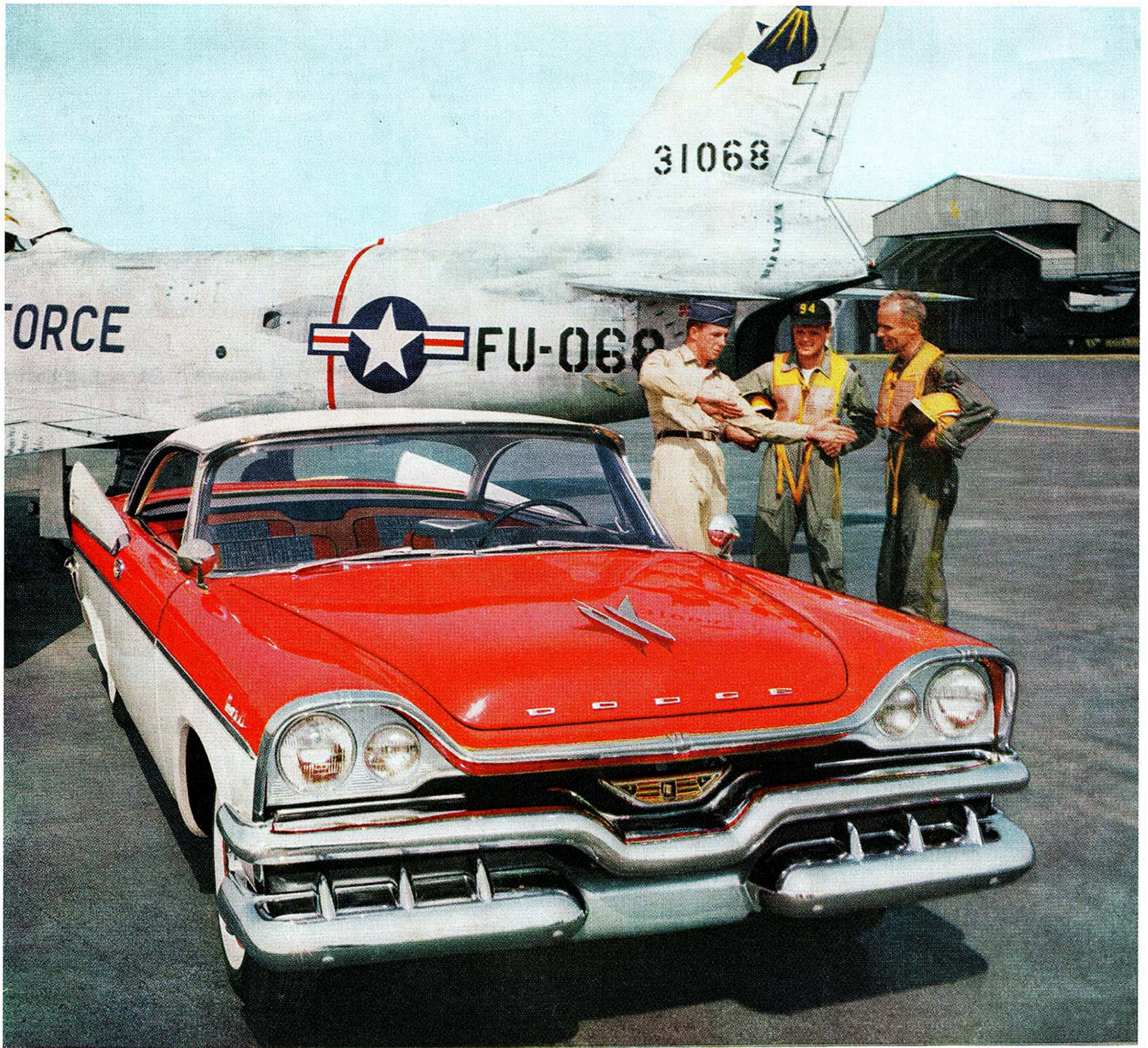
Swept-Wing '57 Dodge Royal Lancer 2-Door with dramatic Flight-Sweep styling.

Step into the wonderful world of AUTODYNAMICS