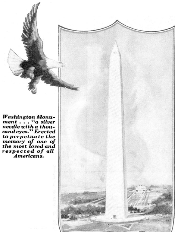
Washington Monument . . . "a silver needle with a thousand eyes." Erected to perpetuate the memory of one of the most loved and respected of all Americans.

OAKLAND MOTOR CAR CO., PONTIAC, MICHIGAN