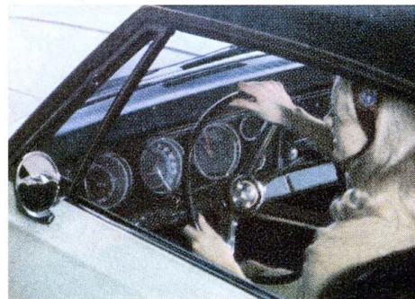
Look for this Mark of Excellence