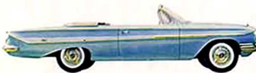
Impala Convertible. Hey, all you top-downers out there—look what Chevy's got!

New! Big-car comfort at small-car prices... NEW '61 CHEVY BISCAIYNE 6 the lowest priced, full-sized Chevrolet