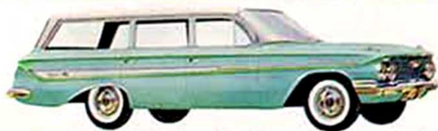
Nomad 9-Passenger Station Wagon. One of 6 easier loading Chevy wagons!