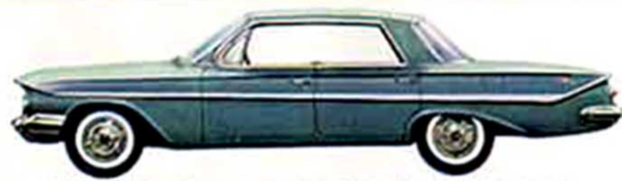
Bel Air Sport Sedan. How about Chevy's new 4-door hardtop roof line!