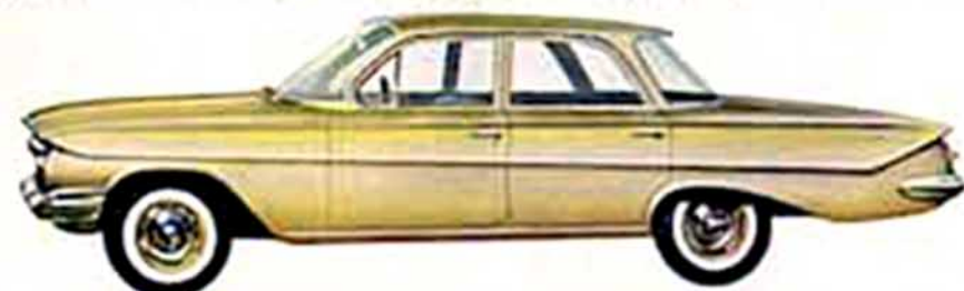
Biscayne 4-Door. Lets you keep to a budget and still enjoy big-car quality.

New! Big-car comfort at small-car prices... NEW '61 CHEVY BISCAIYNE 6 the lowest priced, full-sized Chevrolet