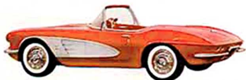
New '61 Corvette. Squeeze your cap and get a taste of the real McCoy!

here's the choice that makes choosing a new car easier than ever!