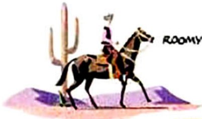
ROOMY AS TEXAS!