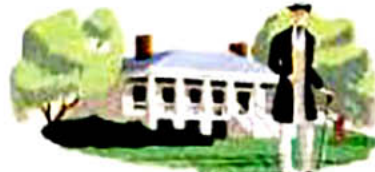
GRACIOUS AS KENTUCKY!