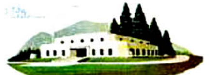
SAFE AS FORT KNOX!