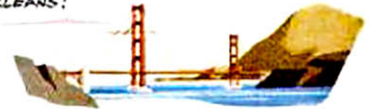
SPIRITED AS SAN FRANCISCO!