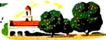
COMFORTABLE AS CALIFORNIA!