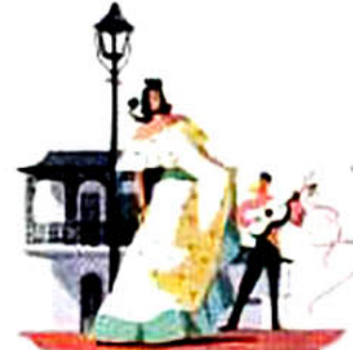
SMOOTH AS NEW ORLEANS!