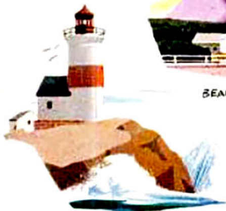
DEPENDABLE AS MAINE!