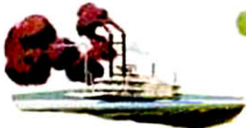
SILENT AS THE MISSISSIPPI!