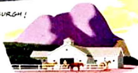
BEAUTIFUL AS WYOMING!

THE forty-eight states* sure are united in favor of Mercury today! For it's made to order for you — wherever you do your driving. And you don't need a Texas oil well to own it and run it. It's "America's No. 1 Economy Car"—the "biggest value since the Dutch bought Manhattan for $24!" Don't just take our word—let your Mercury dealer prove it to you!