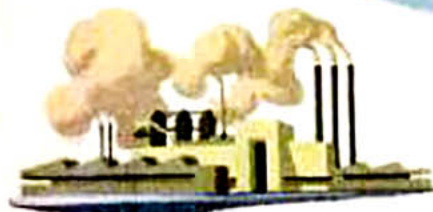
POWERFUL AS PITTSBURGH!