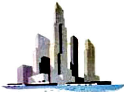
LIVELY AS NEW YORK!