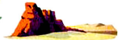
VISIBILITY LIKE ARIZONA'S!