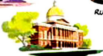
RESTFUL AS BOSTON!