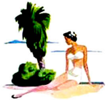
POPULAR AS A FLORIDA BEACH!