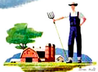
THRIFTY AS VERMONT!

* If your state isn't shown above, it's because space didn't permit. But you can be sure it's another Mercury state, too!