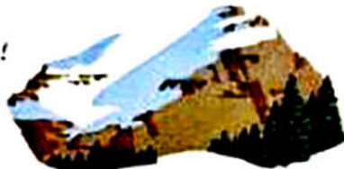
RUGGED AS THE ROCKIES!