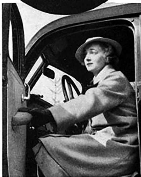
THE DOORS of the Airflow are as wide as those in a house. Both doors open at the center post for easy entrance and exit.

But as we say... words can't give you the thrill of this amazing car... you must drive it. Ask your dealer for an Airflow De Soto with the Automatic Overdrive... and watch for a miracle when the speedometer touches 45!