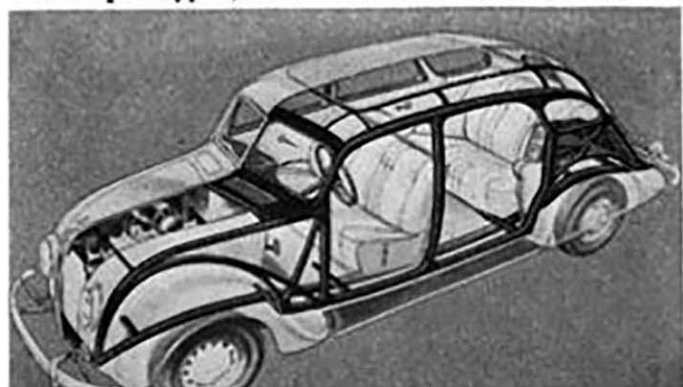
(Left) All-Steel Body and Frame built like a bridge, one single unit from bumper to bumper.

Airflow DE SOTO COMPANION TO THE $695* AIRSTREAM DE SOTO *All prices, list at Factory, Detroit